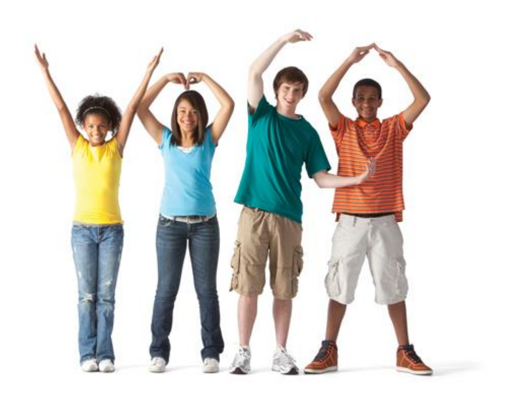
The Y: We're for youth development, healthy living, and social responsibility.

Thank you for your interest in a potential Board of Directors position with the YMCA!